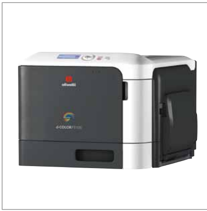
Professional printer with stylish design