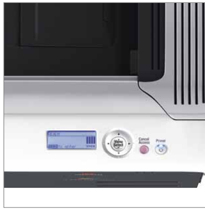
4-line LCD operator panel