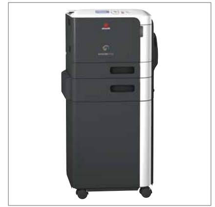
3 input paper trays